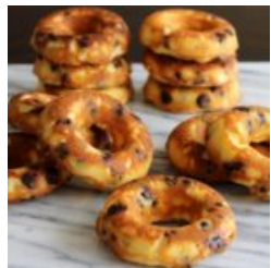
Chocolate Chip Donuts