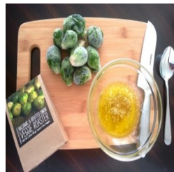
Balsamic-Glazed Roasted Brussels