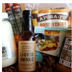
Keto Delivered January 2016