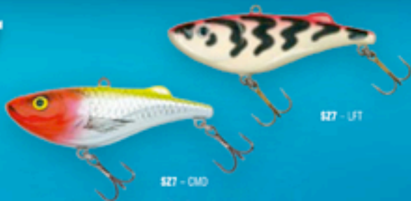
SZ7 - CMD

Again Salmo has shocked the world with the "Zipper." This creative design for a lipless crankbait delivers more vibration, a louder rattle and better overall fishability than anything else in its class. The Zipper will simply trigger more fish to bite. Salmo lure designers worked overtime to create a lipless crankbait that gives the angler the control of speed and depth without losing any performance. Fast or slow, the Salmo Zipper is a fish catcher for sure.