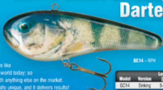
GC14 - RPB