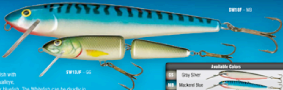
SW13JF - GG

It's a fact. Minnow shaped baits catch fish, and the Salmo Whitefish might catch all the fish! At least that is what many anglers who fish with them think. Cast or troll for monster walleye, pike, bass, muskie, striped, snapper or bluefish. The Whitefish can be deadly in both freshwater and salt. The Salmo Whitefish family of lures offers a large selection of versions, lip styles and configurations. Bass anglers love the large profile of the SW13 for casting. Jointed models work well at slow speeds that drive walleye crazy. The SX series with metal lips track true at speeds up to 15 MPH. The largest Whitefish, the 18, has become the ultimate "witch bait" for muskie fans. Built super strong, you will never be disappointed with the action of any Salmo Whitefish.