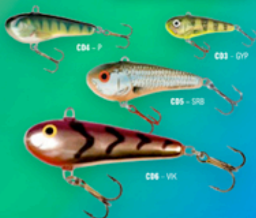
CD4 - P