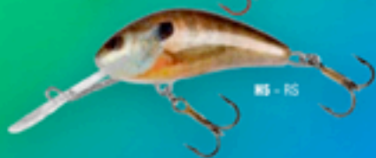
#5 - RS