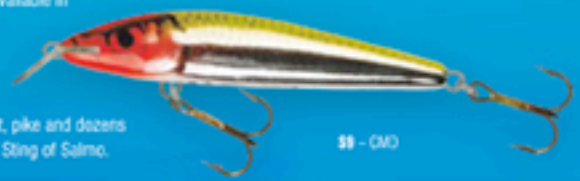
#9 - CMO