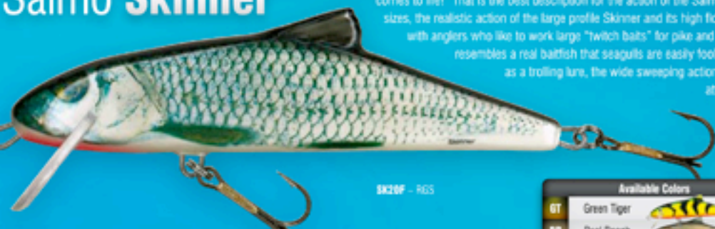
SK20F - RGS

When anglers first cast out a Salmo Skinner, the first words out of their mouth are, "Wow, the lure comes to life!" That is the best description for the action of the Salmo Skinner. Available in three sizes, the realistic action of the large profile Skinner and its high floatation make this bait a favorite with anglers who like to work large "witch baits" for pike and muskie. The lure so closely resembles a real baitfish that seagulls are easily fooled, so fish with care. Deadly as a trolling lure, the wide sweeping action of the Skinner really gets the