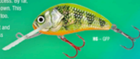
#6 - GFP